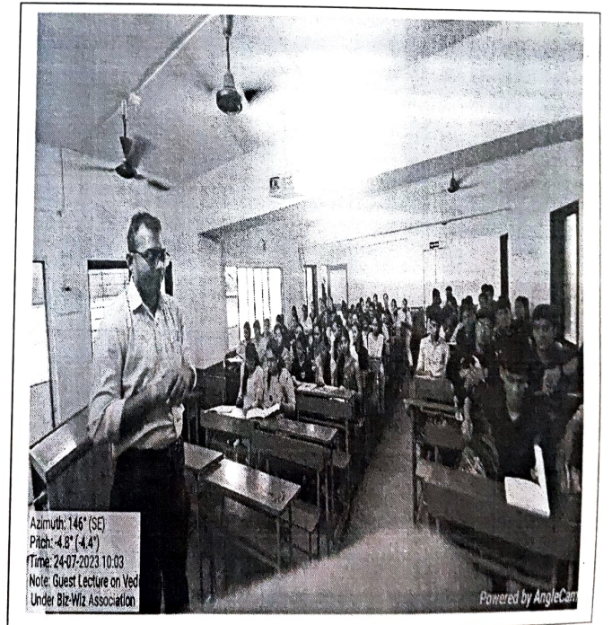
“Guest Lecture on Vedic Mathematics” guidance to the students of FYBBI and TYBBI students conducted on 24/07/2023.