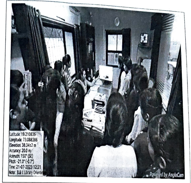
“Library visit (E-Resource of Library)” conducted on 21 st July, 2023 for FYBBI and SYBBI students.